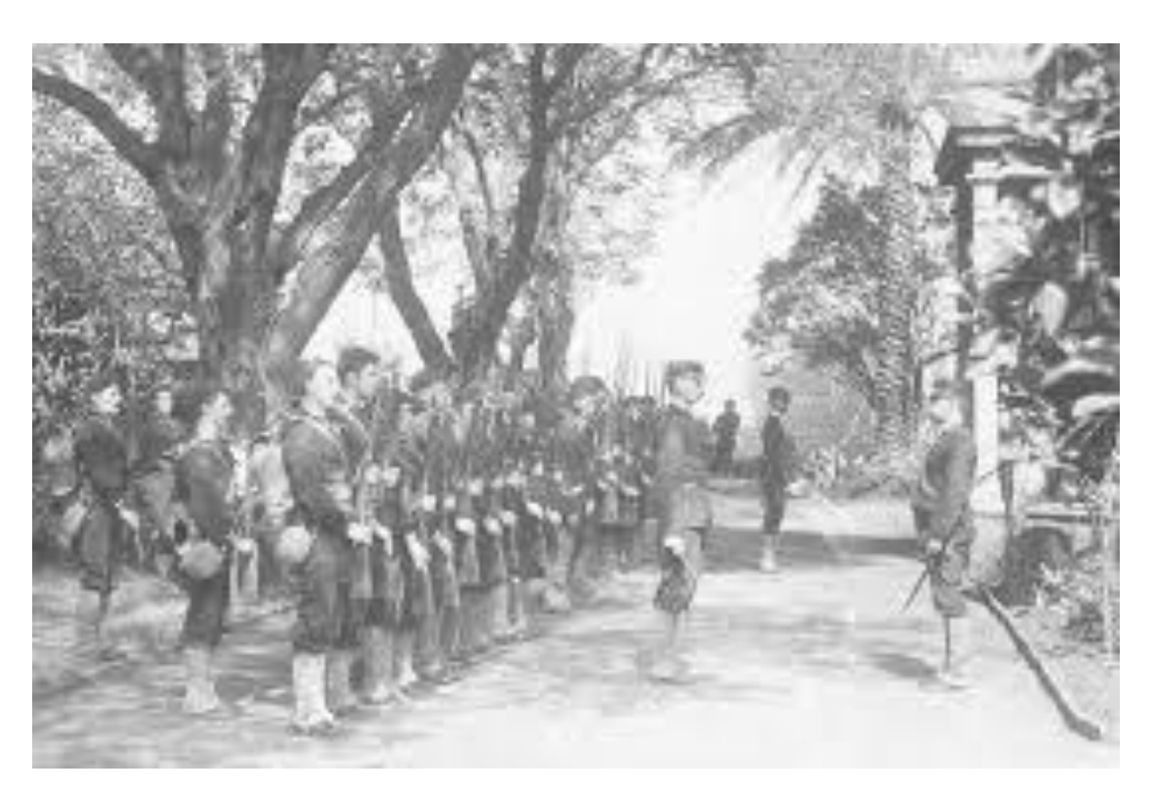
Troops from the USS Boston Honolulu January 17, 1893