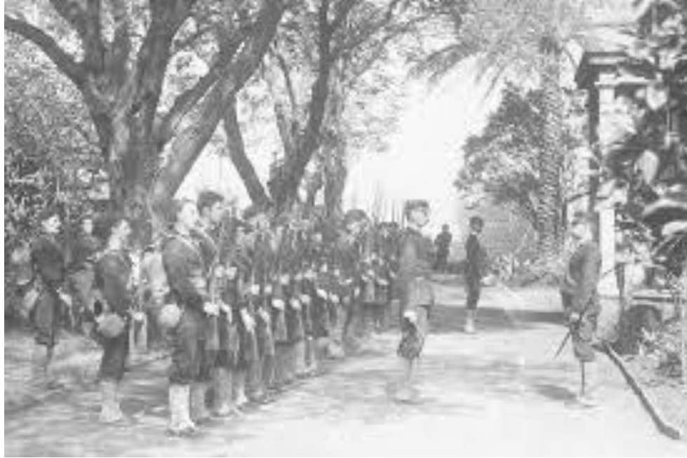
Troops from the USS Boston Honolulu January 17, 1893